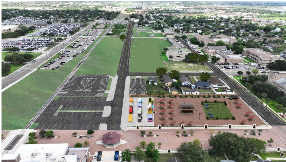
Ex. 2 (Food Truck - Conceptual Plan Example)