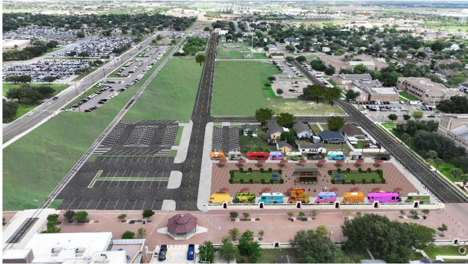
Ex. 1 (Food Truck - Conceptual Plan Example)