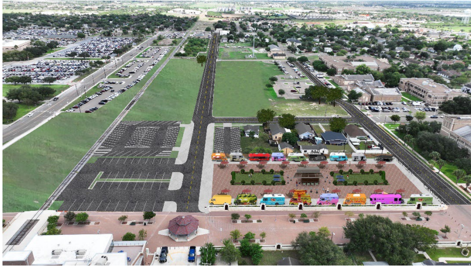
Ex. 1 (Food Truck - Conceptual Plan Example)