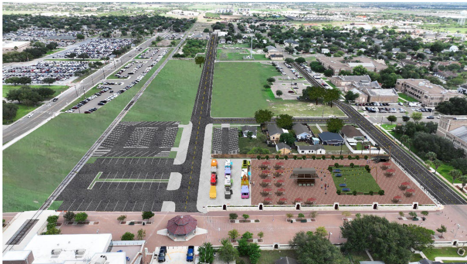
Ex. 2 (Food Truck - Conceptual Plan Example)